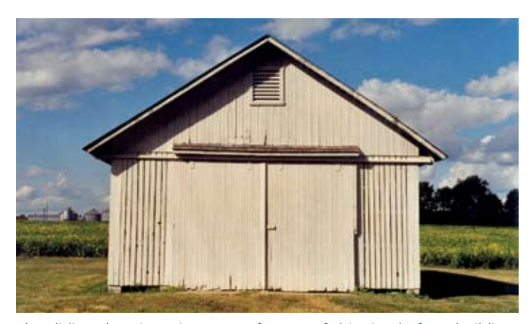
The sliding door is an important feature of this simple farm building.

If your property is located in a National Register district, it still must be designated by the National Park Service as a property that contributes to the historic character of the district, thus qualifying it as a "certified historic structure." Not every barn in a district is contributing. For example, when historic districts are designated, they are usually associated with a particular time period, such as "1880 to 1935." In this case, a 1950 barn would not contribute and would not be eligible for a 20% rehabilitation tax credit. On the other hand, a barn dating to 1932 could be eligible for the tax credit.