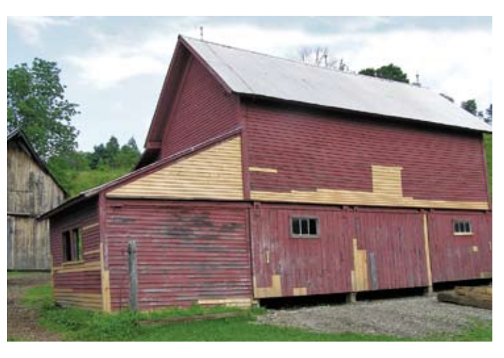
The siding on this barn was repaired with matching siding, a treatment that meets the Secretary of the Interior's Standards for Rehabilitation.

The addition of a large number of regularly spaced windows (shown above) to this primarily blank barn facade (left) does not meet the Secretary of the Interior's Standards for Rehabilitation.